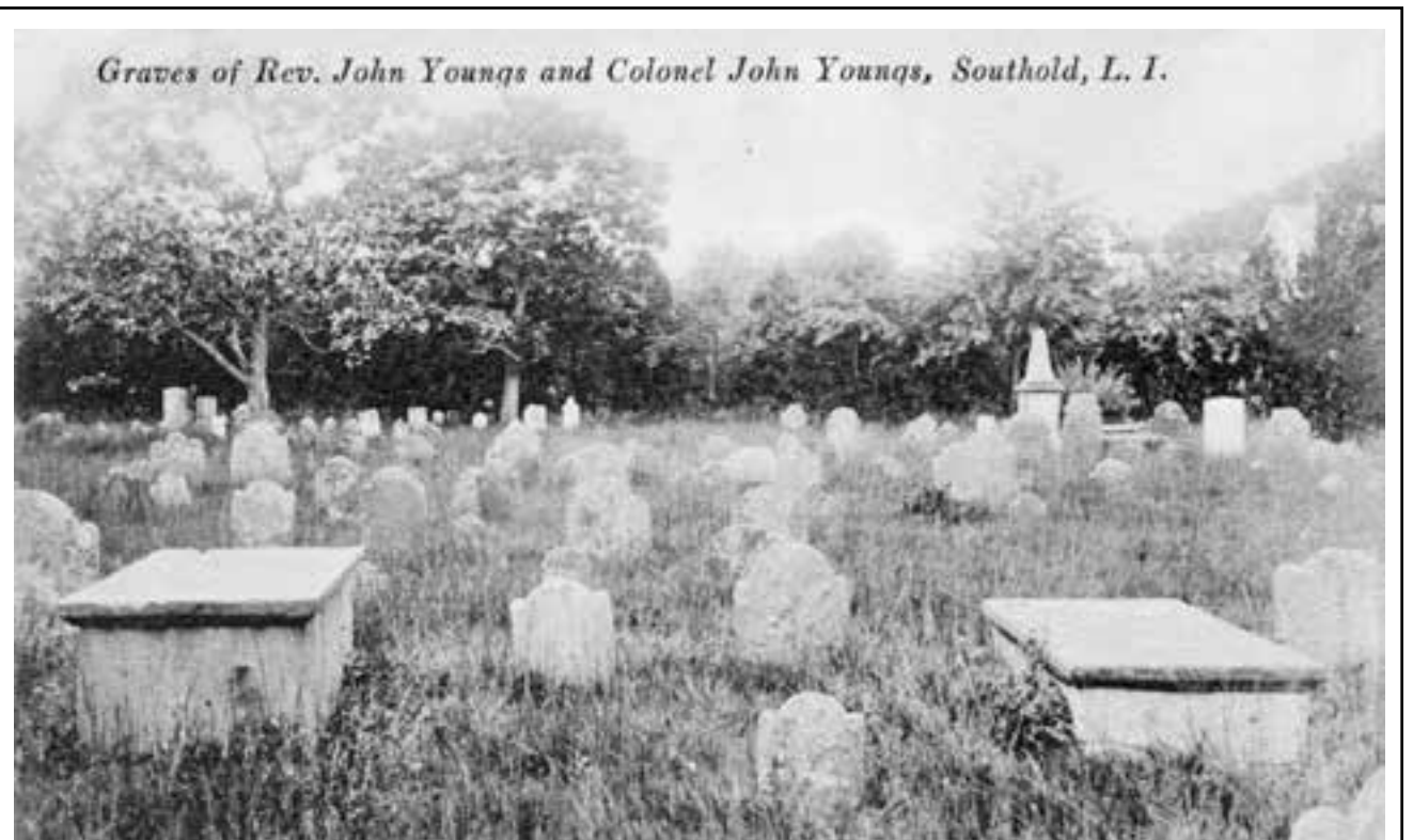
Postcard published by H. M. Hawkins, Southold Long Island. Required postage reads "United States and Island Possessions, Cuba, Canada and Mexico: ONE CENT. All other Countries: TWO CENTS"