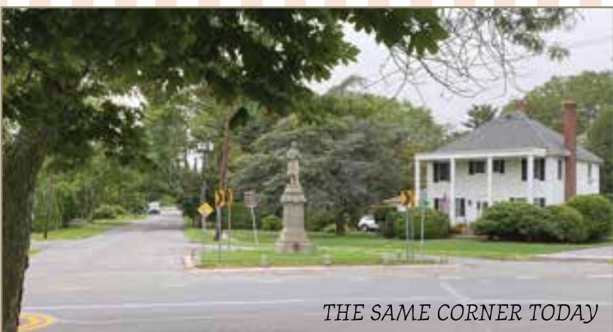
THE SAME CORNER TODAY