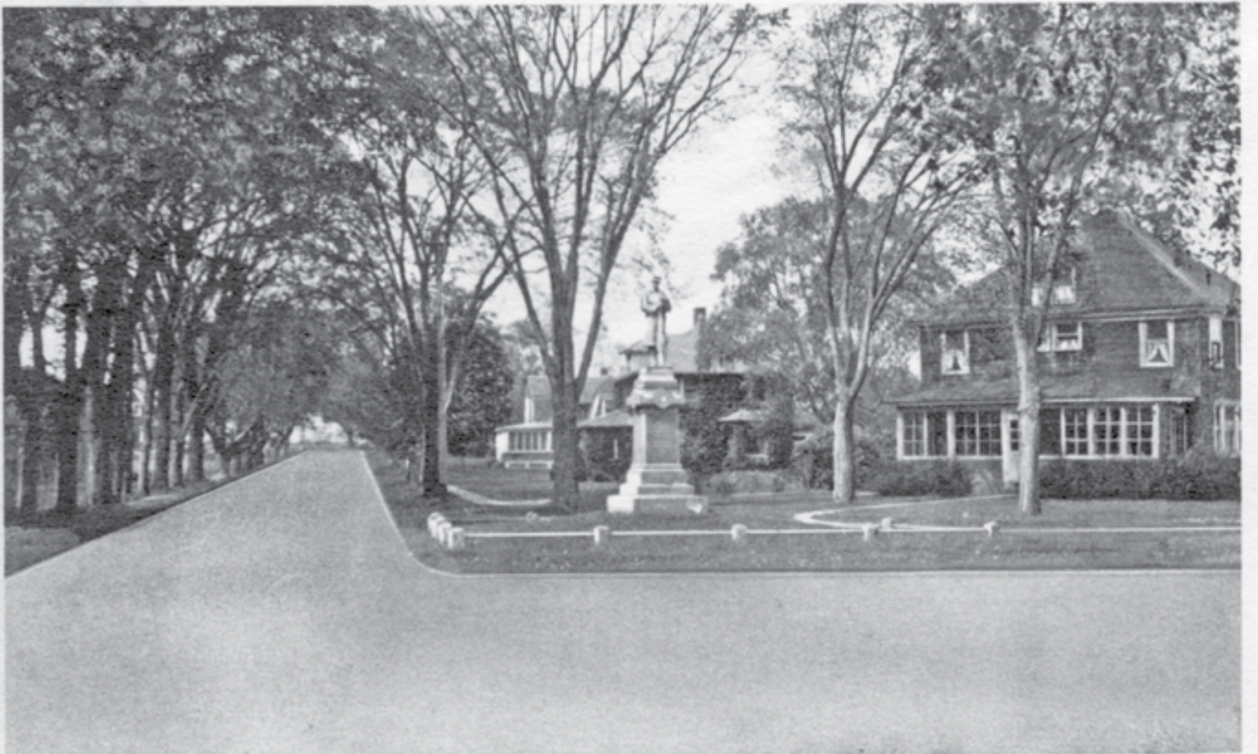
SOLDIERS' MONUMENT AND THE LANE TO THE SOUND SOUTHOLD, LONG ISLAND, N. Y.