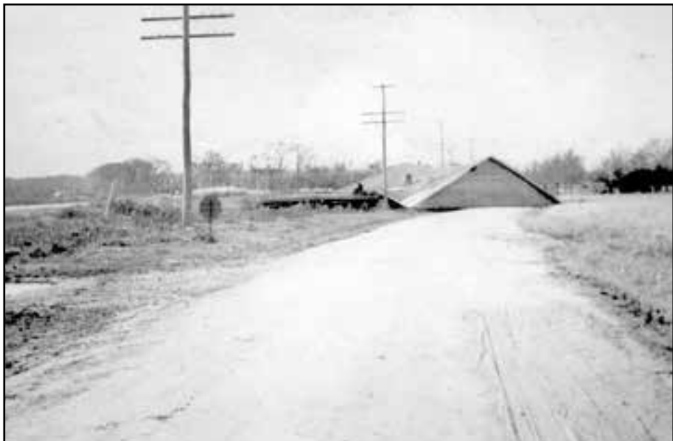
Point Road, Orient showing the potato building roof on the road after the hurricane.