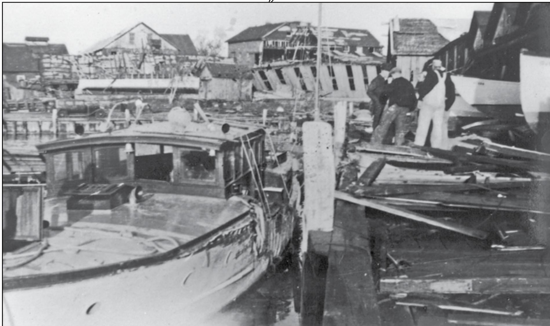
Greenport Village following the Hurricane of '38, courtesy of the Stirling Historical Society.