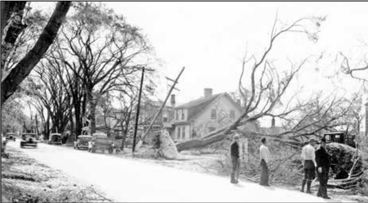
September 21, 1938 Main Road, Southold, Residence of Leila Myers.