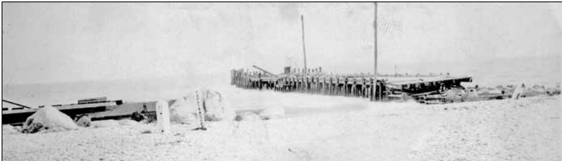
The Orient dock after the hurricane.