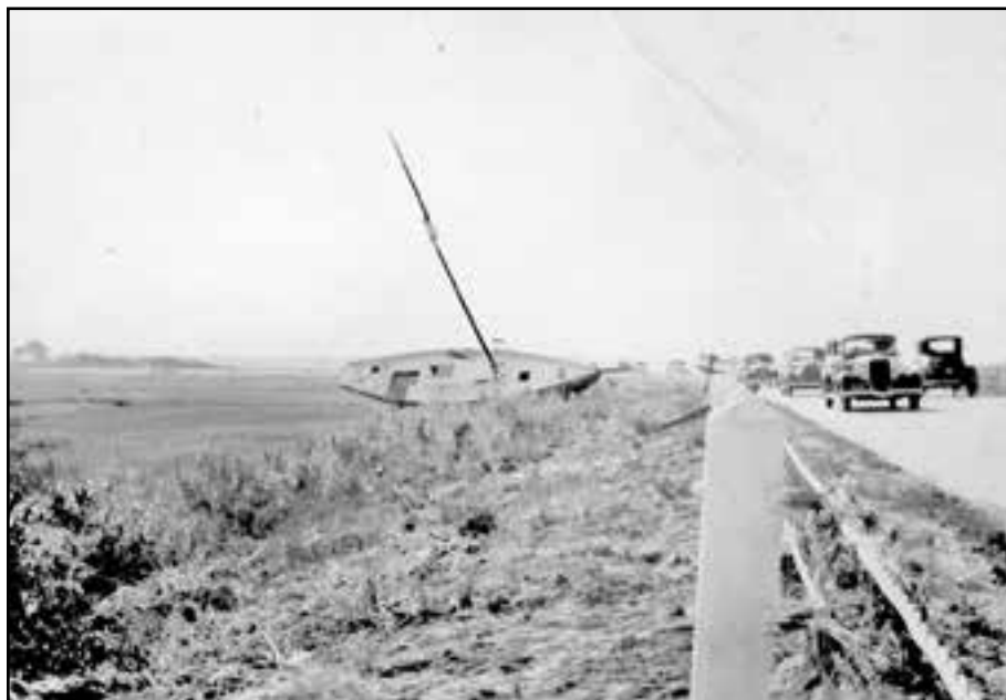
A view of the Orient Causeway after the hurricane.