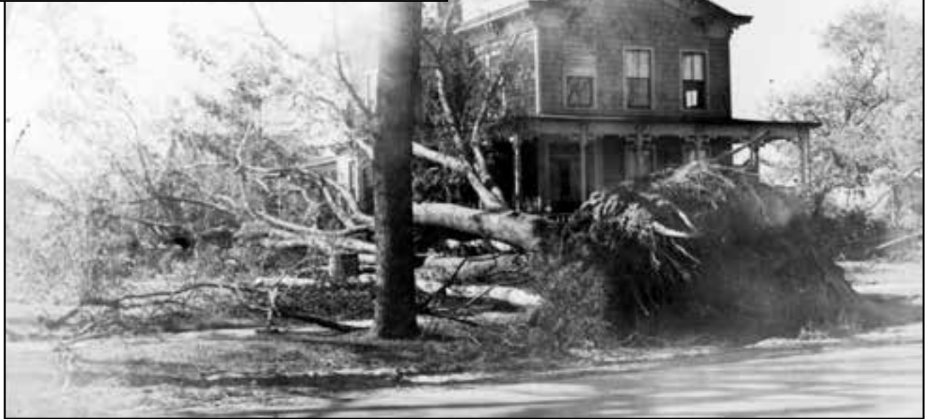
West Main Street, Southold, between Bowery Lane and Tuckers. Residence of Bud Miller during the 1938 hurricane.