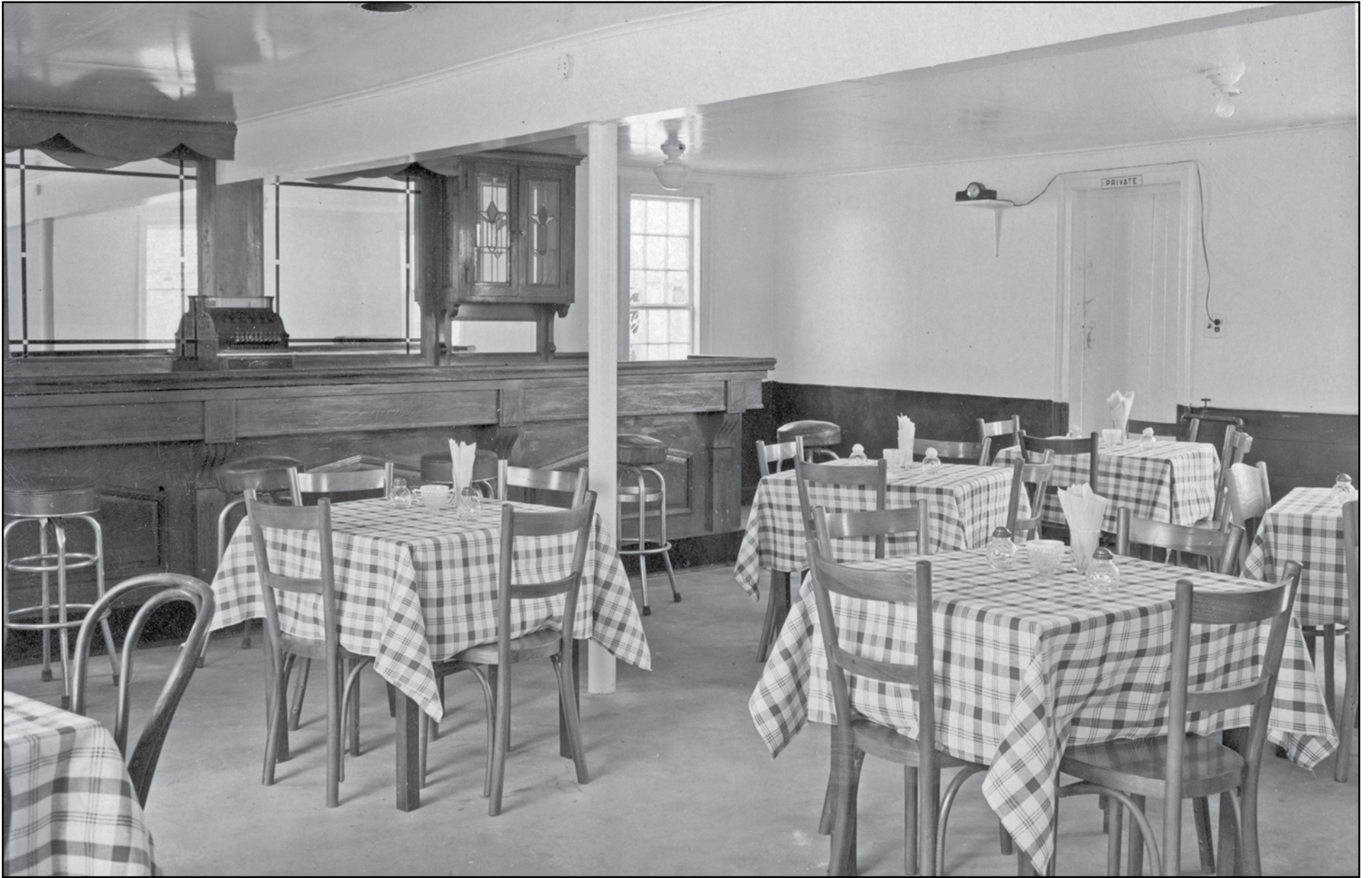
Inside Fisherman's Rest Restaurant, 1948.

“One misty, moisty morning, when cloudy was the weather...”