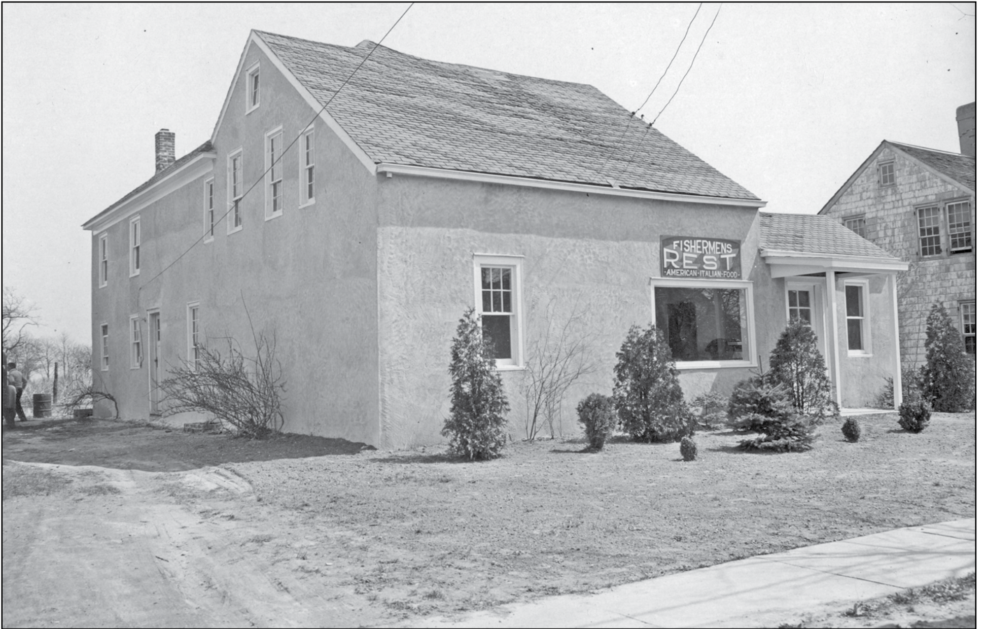
Fisherman's Rest Restaurant, 1948. Note the plantings in this and following photos.