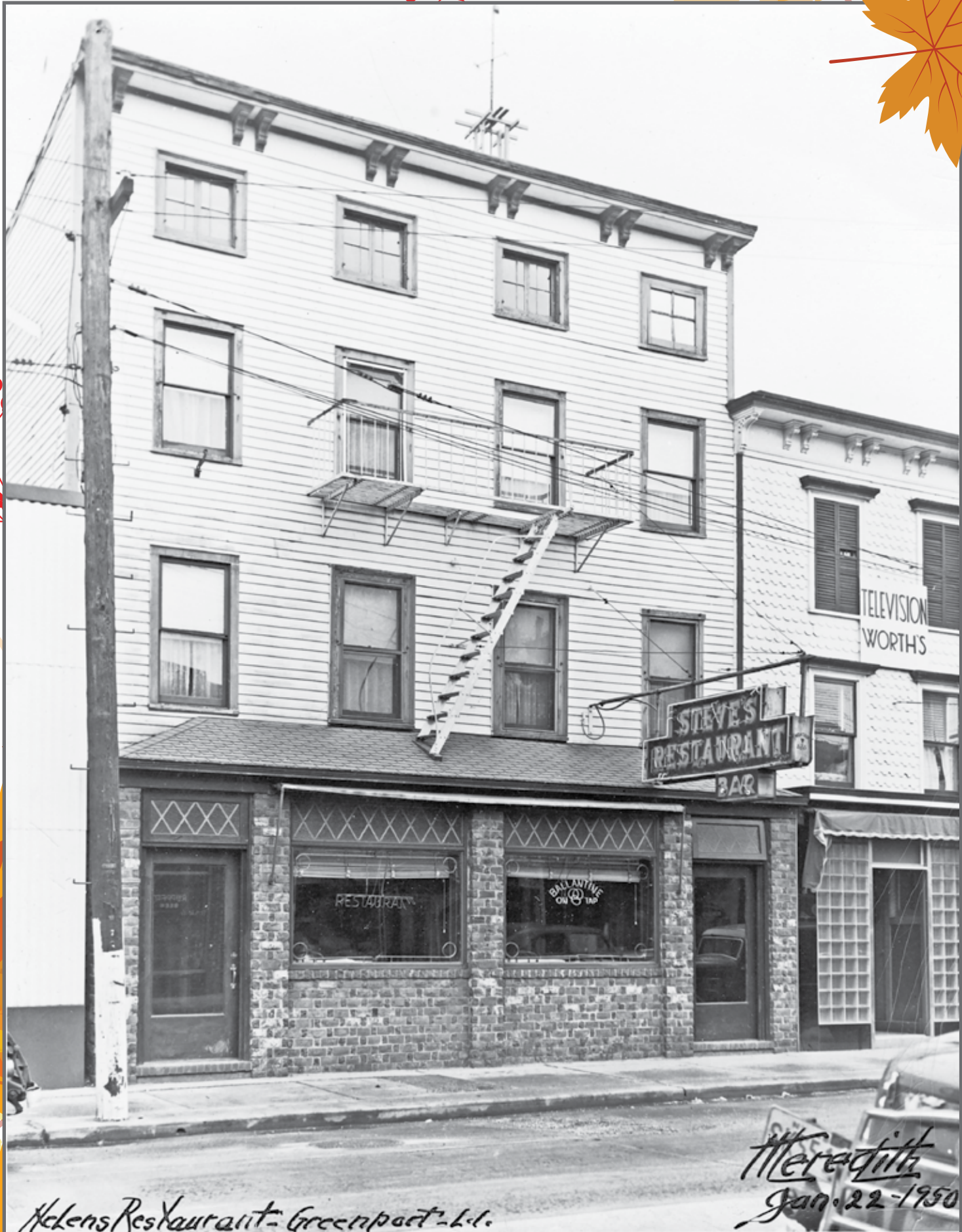
Helens Restaurant - Greenport - L.I.