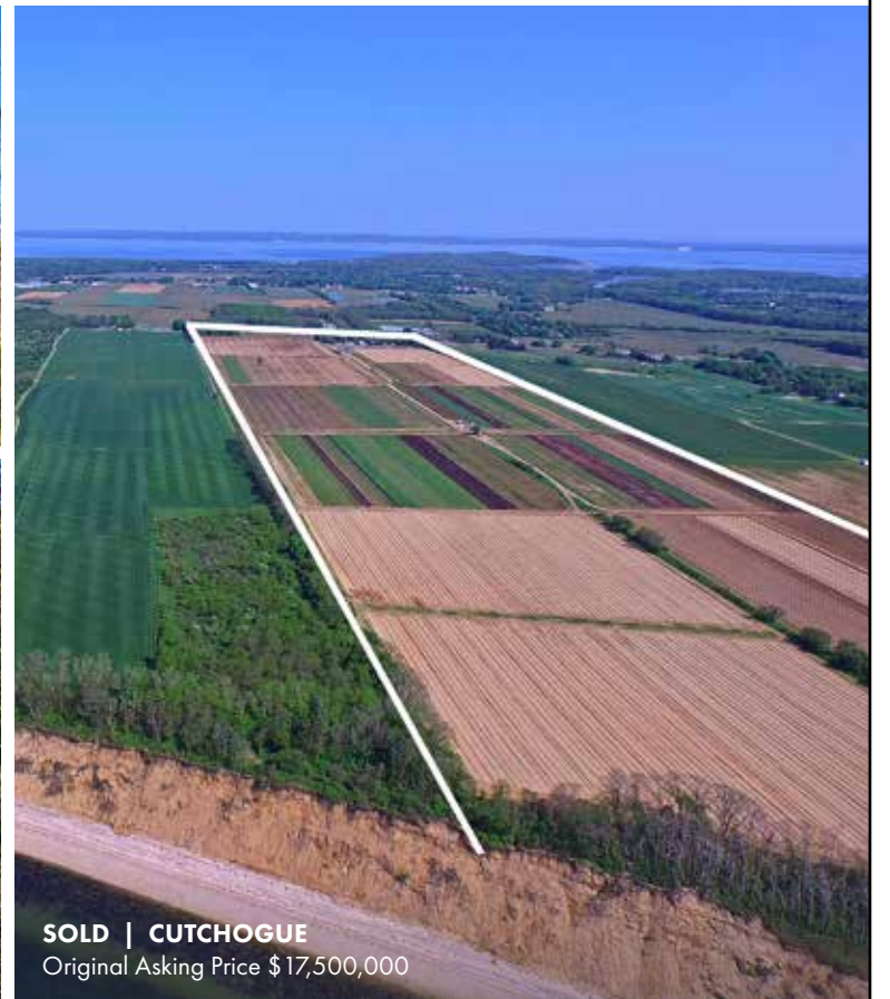
SOLD | CUTCHOGUE Original Asking Price $17,500,000