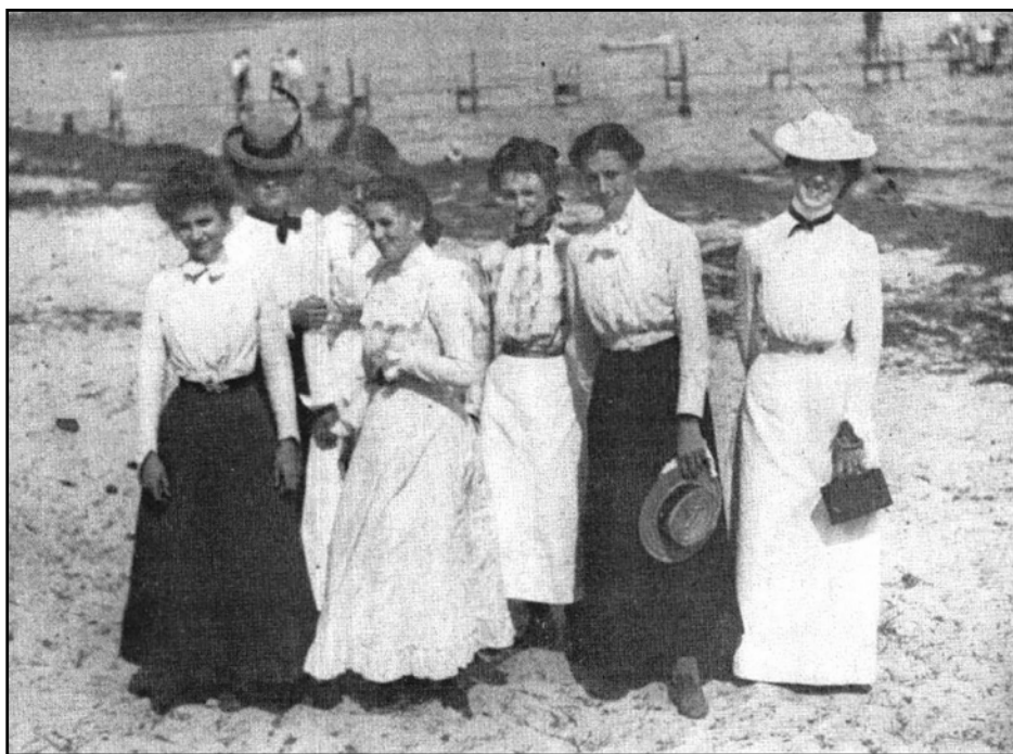
Husing's Beach, Mattituck, on a sunny afternoon, c. 1905.