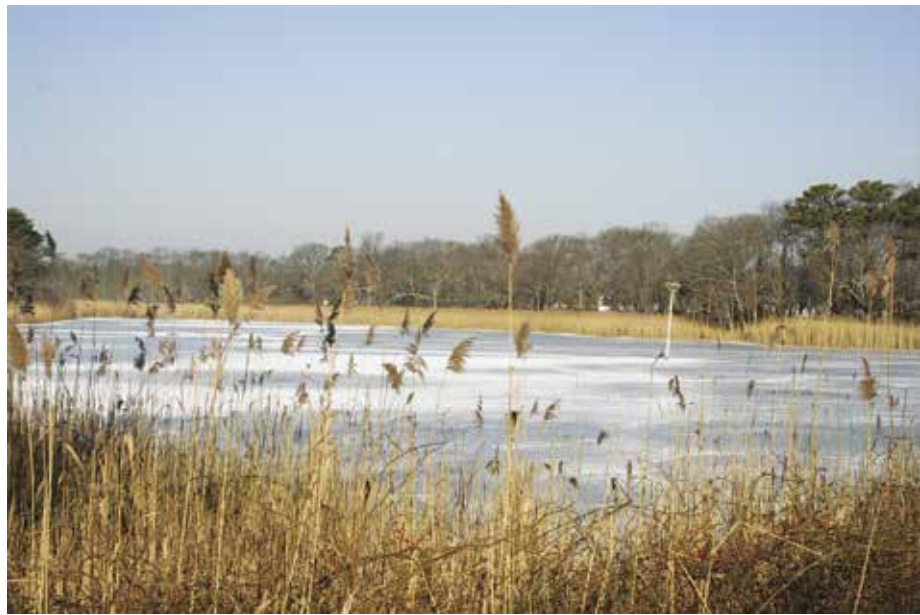
The Husing Pond Preserve on Peconic Bay Boulevard in winter.