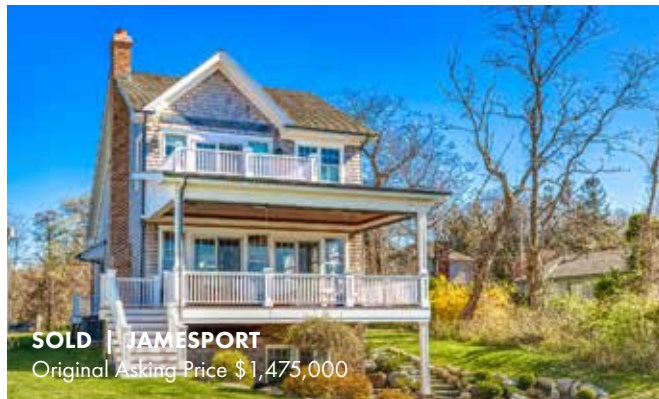
SOLD | JAMESPORT Original Asking Price $1,475,000