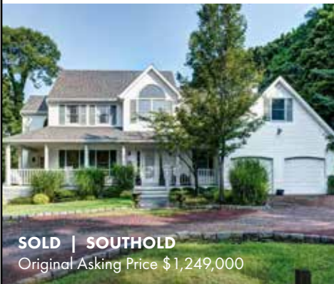
SOLD | SOUTHOLD Original Asking Price $1,249,000