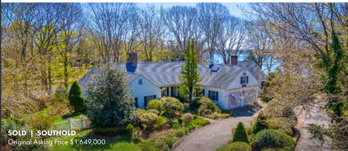
SOLD | SOUTHOLD Original Asking Price $1,649,000