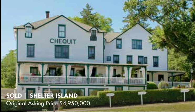
SOLD | SHELTER ISLAND Original Asking Price $4,950,000