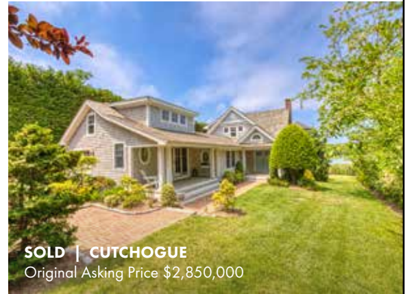
SOLD | CUTCHOGUE Original Asking Price $2,850,000