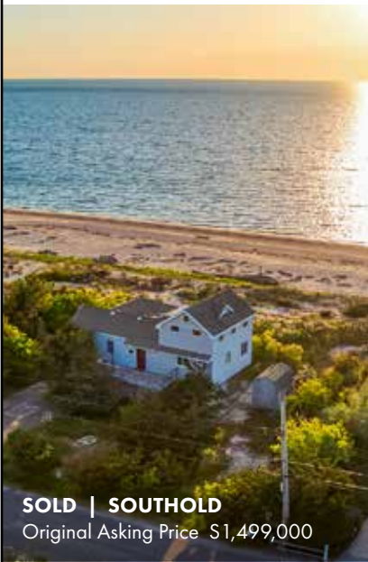
SOLD | SOUTHOLD Original Asking Price $1,499,000