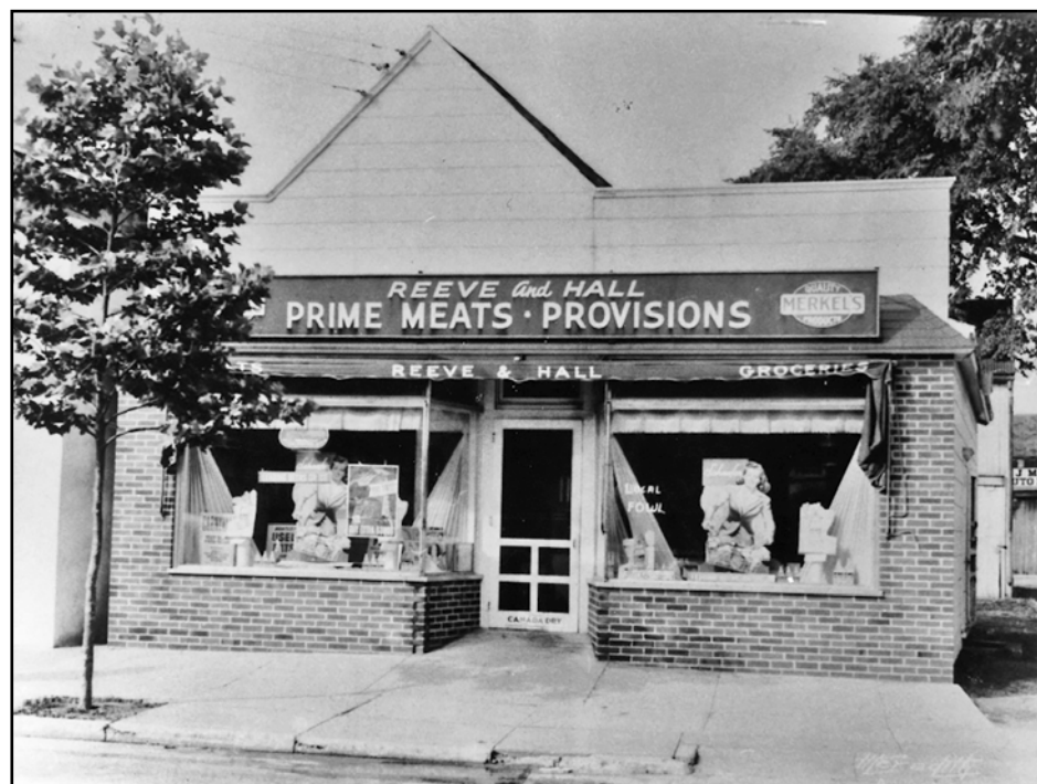
Reeve and Hall Meats and Provisions on Love Lane, c. 1947. The store, which closed in 1949, is the present location of Love Lane Kitchen.