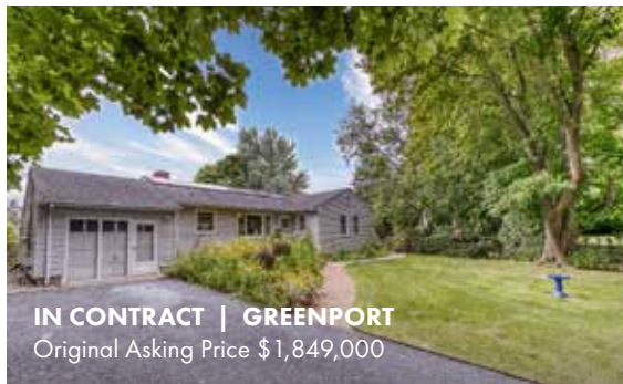
IN CONTRACT | GREENPORT Original Asking Price $1,849,000