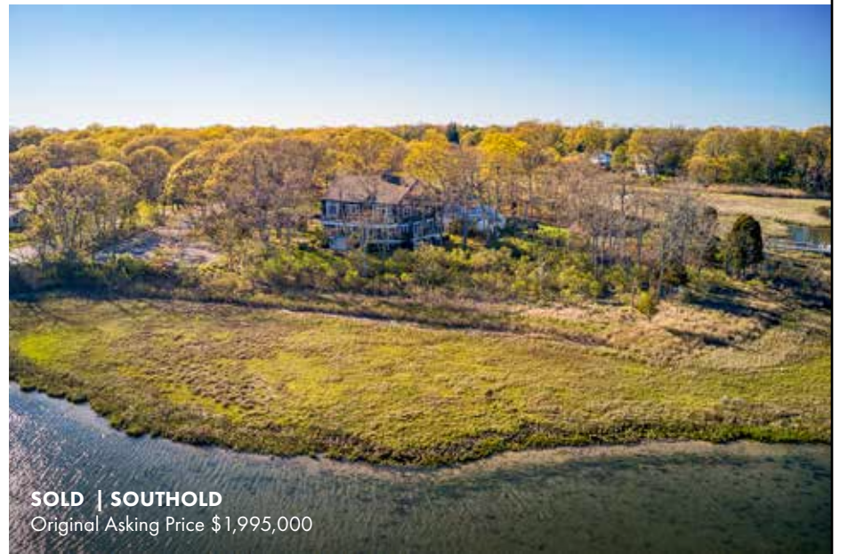
SOLD | SOUTHOLD Original Asking Price $1,995,000