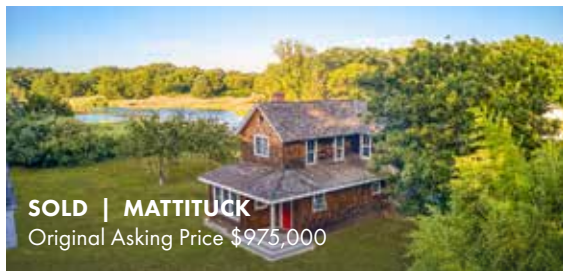
SOLD | MATTITUCK Original Asking Price $975,000