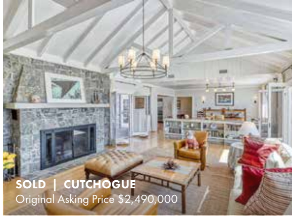
SOLD | CUTCHOGUE Original Asking Price $2,490,000