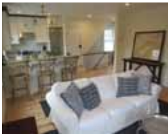
SOUTHOLD PIED-ATERRE UNIT C MD-LD: $18,500; June: $4,000 July: $8,000; Aug(-LD): $10,000 Ext. Season: $4,000 WEB # 99352