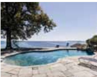
SUBLIME PECONIC BAYFRONT RESIDENCE ON 6 ACRE WITH WATERSIDE POOL Ext. Season: $6,000 WEB # 88765