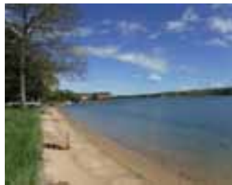
BAYFRONT RENTAL OVERLOOKING SHELTER ISLAND Short Term/Weekly: $5,000 WEB # 94914