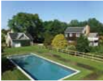
ULTIMATE NORTH FORK WITH POOL IN SOUTHOLD MD-LD: $48,000; June: $12,000 July: $20,000; Aug(-LD): $25,000 Ext. Season: $12,000 WEB # 95787