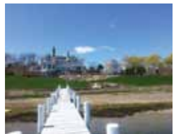
SHELTER ISLAND, EXTRAORDINARY COMPOUND August - Labor Day $120,000 WEB # 61058