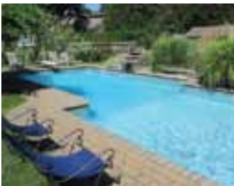
MODERN HARBOR LIGHTS WEEKEND BEACH HOUSE August $25,000 WEB # 58538