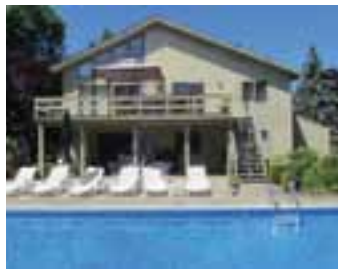
SOUTHOLD CONTEMPORARY WITH POOL - CLOSE TO TOWN BEACH July: $18,000; Aug(-LD): $18,000 Ext. Season: $10,000 WEB # 97160