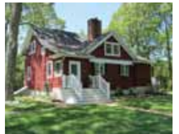
SOUTHOLD CEDAR BEACH BAYVIEW AREA SCHOOLHOUSE June: $8,000; July: $10,000 Aug(-LD): $12,000 Ext. Season: $8,000 Short Term/Weekly: $2,500. WEB # 96034