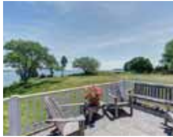
NEW SUFFOLK, NORTH FORK! MD-LD: $40,000; June: $10,000 July: $16,000; Aug(-LD): $22,000 Ext. Season: $12,000 WEB # 75017