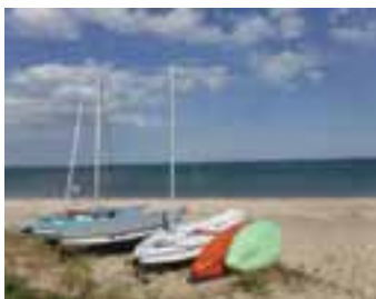
THE PERFECT NORTH FORK COTTAGE Short Term/Weekly: $2,000 WEB # 97752