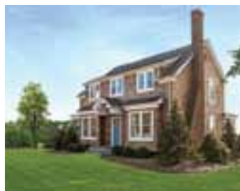
MATTITUCK MODERNIST FARMHOUSE MD-LD: $25,000; June: $8,000; July: $10,000; Aug(-LD): $12,000; Ext. Season: $8,000 Short Term: $3,500 WEB #102119