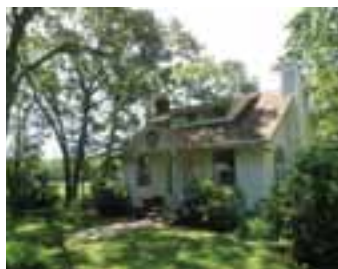
CUTCHOGUE HARBOR COTTAGE MD-LD: $20,000; June: $5,000 July: $8,000; Aug(-LD): $10,000 Ext. Season: $5,000 Year-Round: $31,200 WEB # 61143