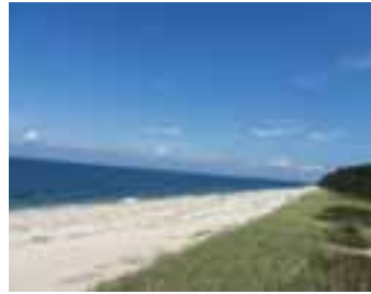
SUNSET KNOLLS ON LI SOUND MD-LD: $40,000; June: $10,000 July: $15,000; Aug(-LD): $20,000 Ext. Season: $10,000 Short Term/Weekly: $3,000 WEB # 79908