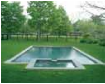
GRAMERCY VINEYARDS CHIC RESIDENCE IN MATTITUCK MD-LD: $50,000; June: $15,000 July: $22,000; Aug(-LD): $27,000 WEB # 61017