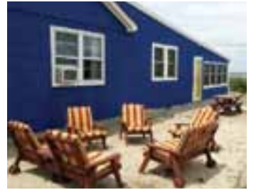
COTTAGE ON THE SOUND MD-LD: $30,000; June: $9,000 July: $11,000; Aug(-LD): $14,000 Ext. Season: $8,000 Short Term/Weekly: $3,000 WEB # 60007