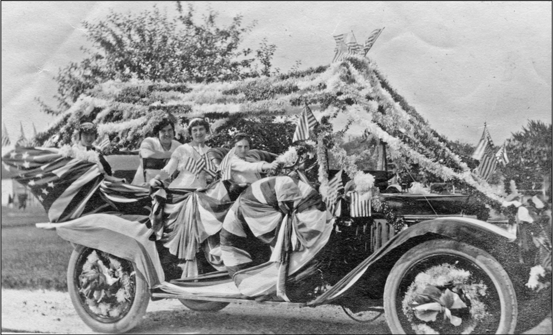
In the early 1900's the local Fourth of July parades were full of cars and floats decorated for the occasion. We have no names for the ladies in this photo. the July Peconic Bay Shopper will have photos of several floats from 1914 and 1915. If only they were in color!