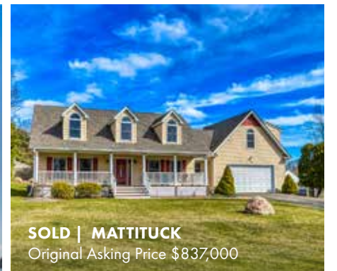
SOLD | MATTITUCK Original Asking Price $837,000