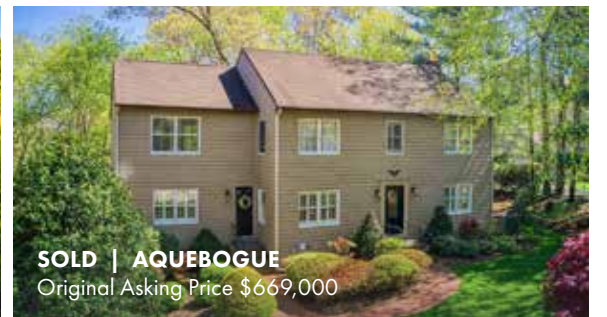
SOLD | AQUEBOGUE Original Asking Price $669,000