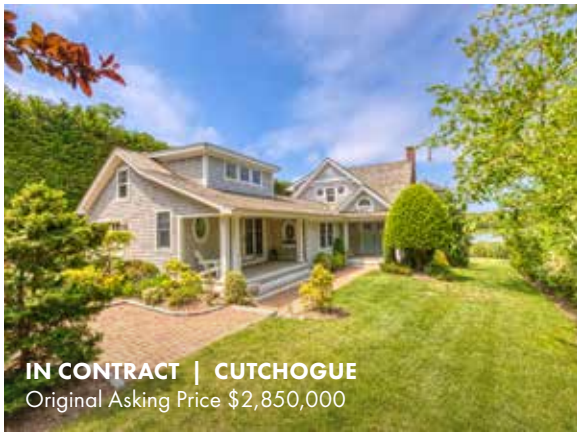
IN CONTRACT | CUTCHOGUE Original Asking Price $2,850,000