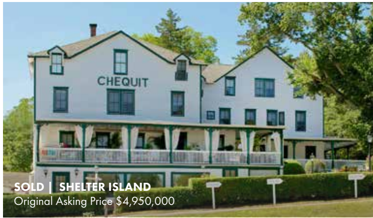
SOLD | SHELTER ISLAND Original Asking Price $4,950,000