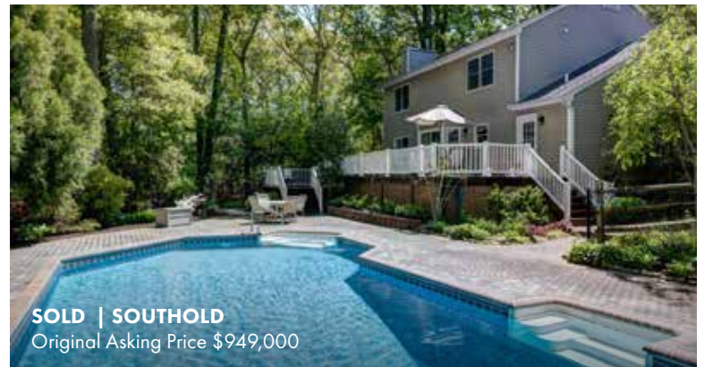
SOLD | SOUTHOLD Original Asking Price $949,000