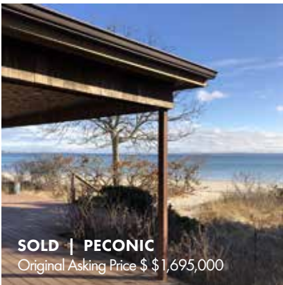
SOLD | PECONIC Original Asking Price $1,695,000