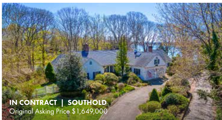
IN CONTRACT | SOUTHOLD Original Asking Price $1,649,000