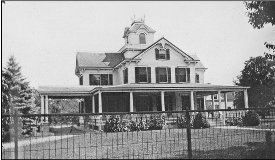
— Benesta Lodge —

Our June Peconic Bay Shopper had these two photos of “Benesta Lodge” on the cover. This beautiful home stood on the south side of the North Road in Greenport. It was torn down in the 1990s.