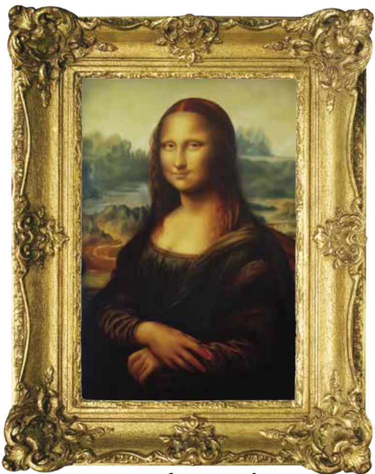
"Mona's favorite place"

GREAT DEALS ON FRAMED ART FOR THE HOME & OFFICE