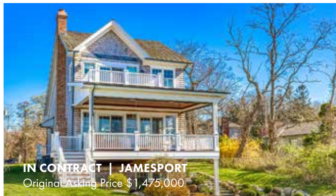
IN CONTRACT | JAMESPORT Original Asking Price $1,475,000