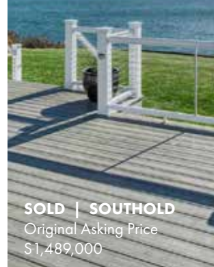
SOLD | SOUTHOLD Original Asking Price $1,489,000