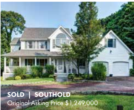
SOLD | SOUTHOLD Original Asking Price $1,249,000