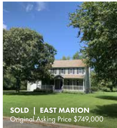
SOLD | EAST MARION Original Asking Price $749,000