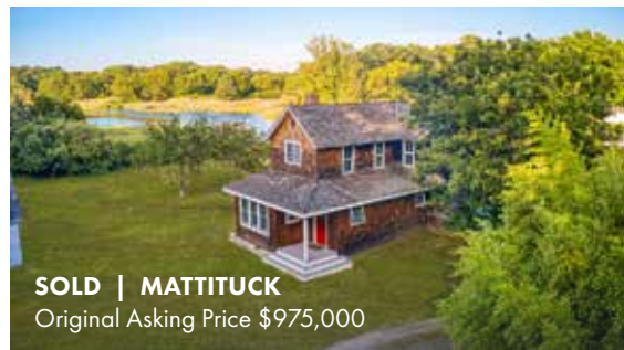
SOLD | MATTITUCK Original Asking Price $975,000