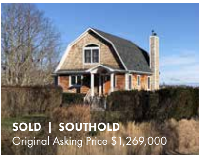
SOLD | SOUTHOLD Original Asking Price $1,269,000