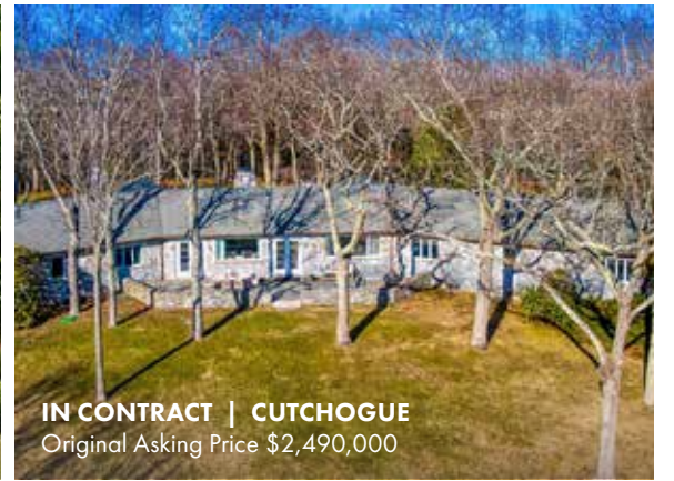
IN CONTRACT | CUTCHOGUE Original Asking Price $2,490,000