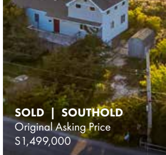
SOLD | SOUTHOLD Original Asking Price $1,499,000