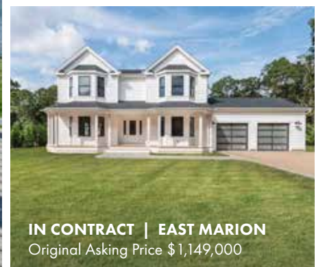
IN CONTRACT | EAST MARION Original Asking Price $1,149,000