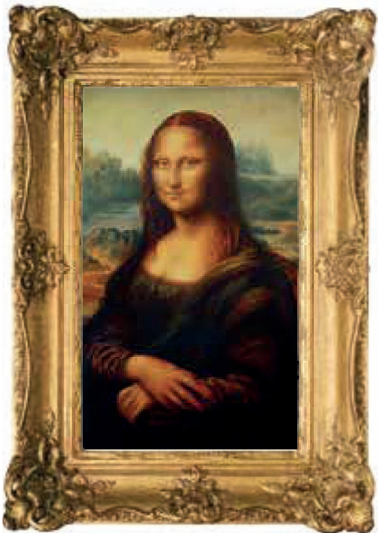
PHOTO LAB • PHOTO RESTORATIONS • ENLARGEMENTS SCANNING • PHOTO STUDIO • DIGITAL ARCHIVING We work from digital files, original photos, negatives or slides. LARGE FORMAT PRINTING • PHOTOS & FINE ART PRINTING

WHOLESALE CUSTOM PICTURE FRAMING WE USE ONLY ARCHIVAL MATERIALS