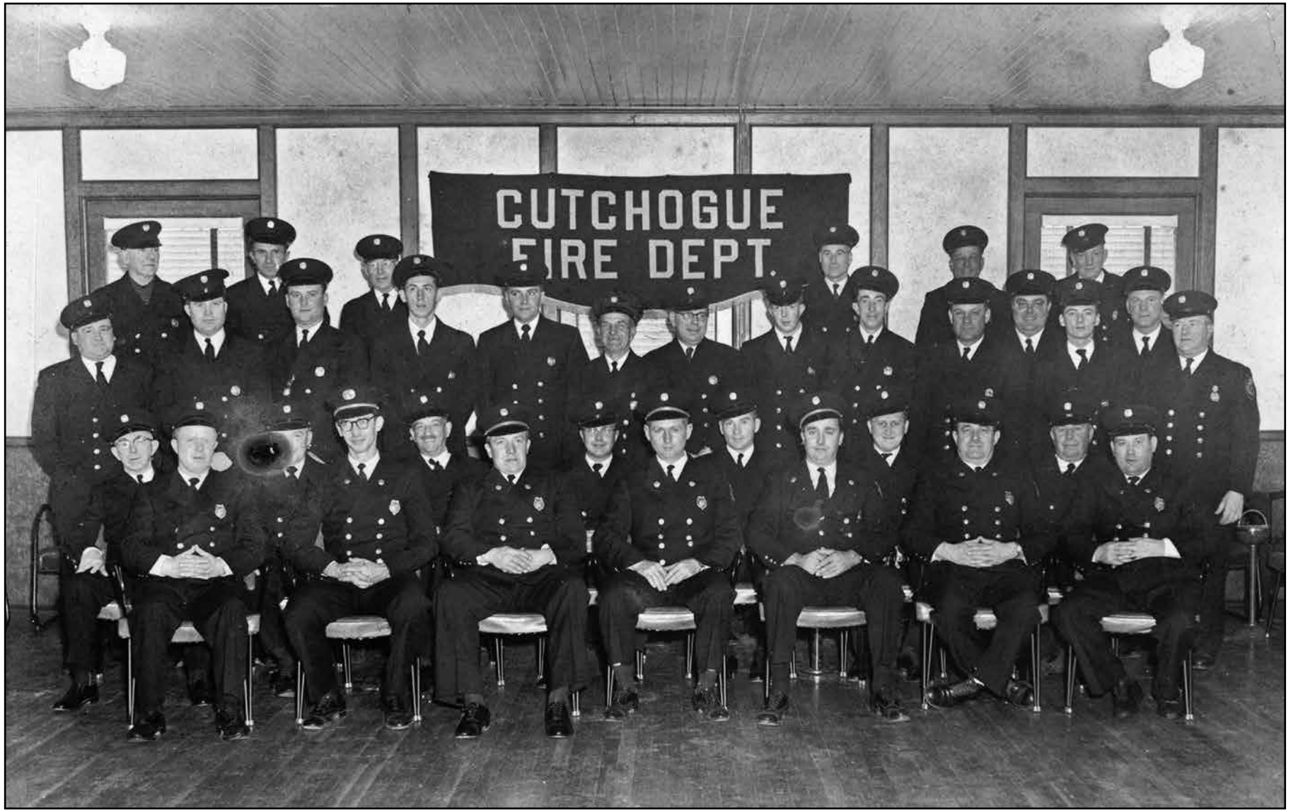
We welcome any info!