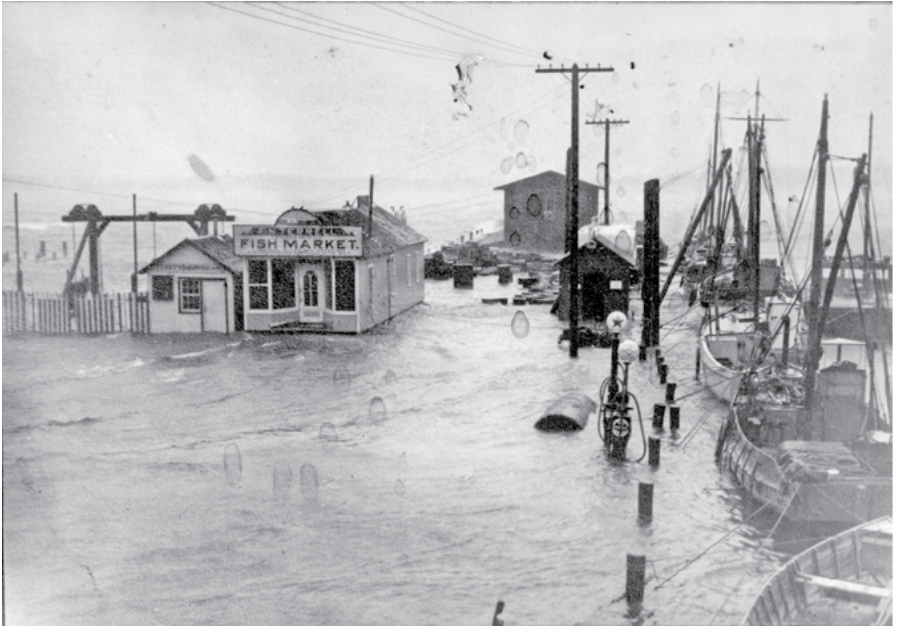
Looking out from Claudio's Restaurant at the dock during the 1938 Hurricane.