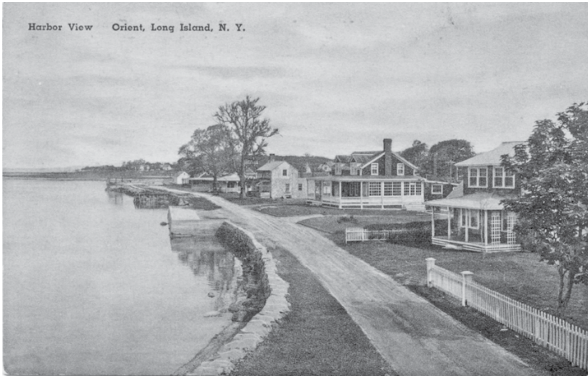
Enlarged postcard of Orient Harbor looking north toward the causeway circa 1880.