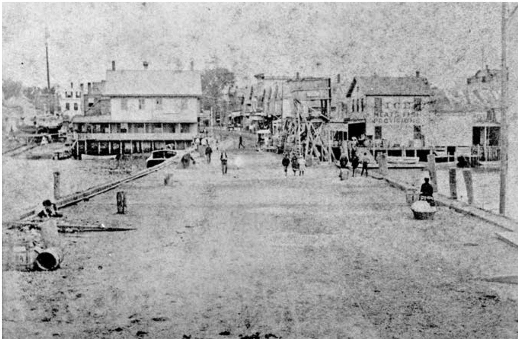
The importance of this photo is the view of the Claudio building where the bay reaches under the dining room. This speak easy had a door through the floor behind the bar where unloading the illegal liquor was a frequent happening during prohibition.