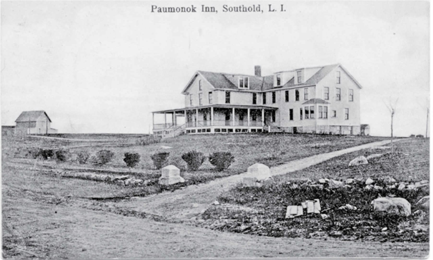
Another enlarged postcard featuring the Paumonok Inn situated high on Horton Point, Southold. This country getaway advertised mostly in the Brooklyn Eagle about the soothing sea breezes and charming country life. Lighthouse Road was commissioned by several local families in that area around 1886 when the road was constructed. The Paumonok Inn burned to the ground, as did so many of the local resort buildings on the North Fork and Shelter Island.