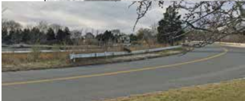
Left photo shows current view looking west over the bridge.