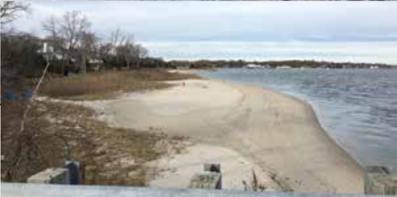
This 1959 Meredith shot shows the same process just west of the bridge with a view towards Founders Landing.