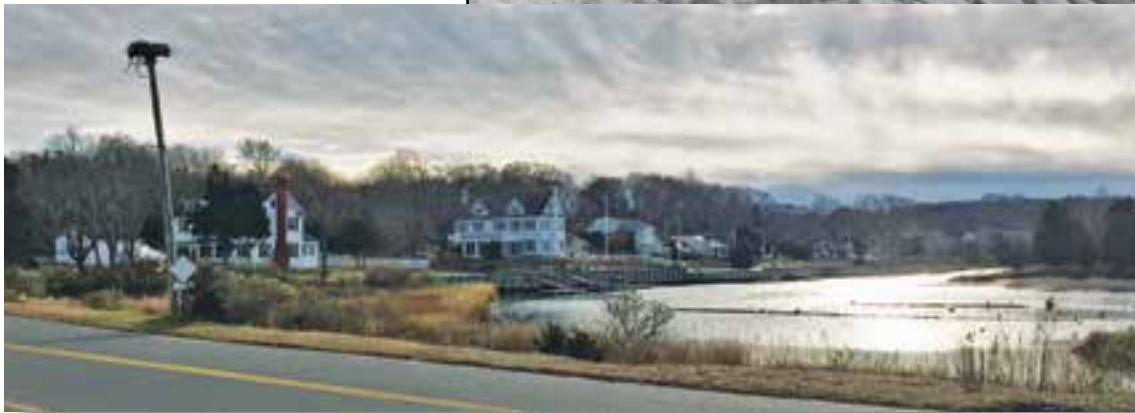
Left photo is a current view showing the same houses across the water from the area that was filled.