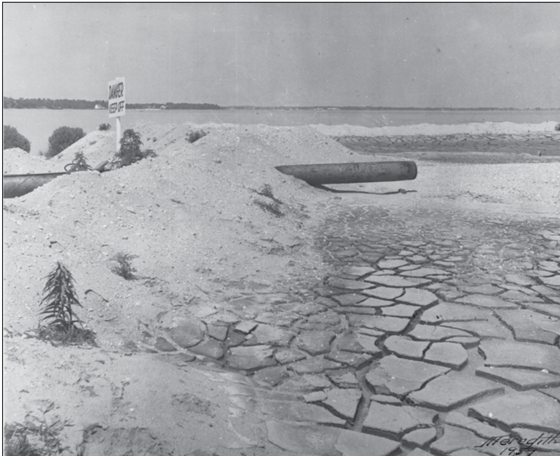
Yet another view. See page 15 for a for a 1959 aerial view of this area.