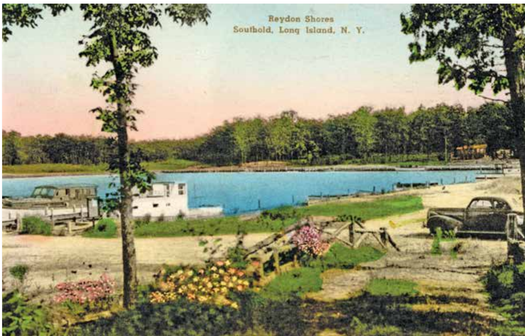
Another postcard published by Hawkin's Stationery Store —this one of Southold's Reydon Shores.