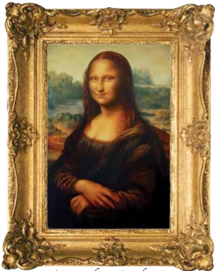
"Mona's favorite place"