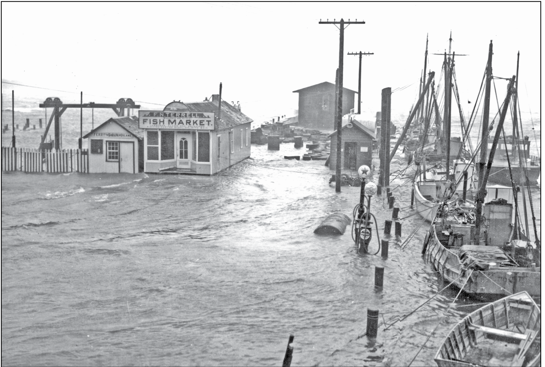
F. N. Terrell Fish Market, viewed from Claudio's Restaurant on the south Main Street dock.