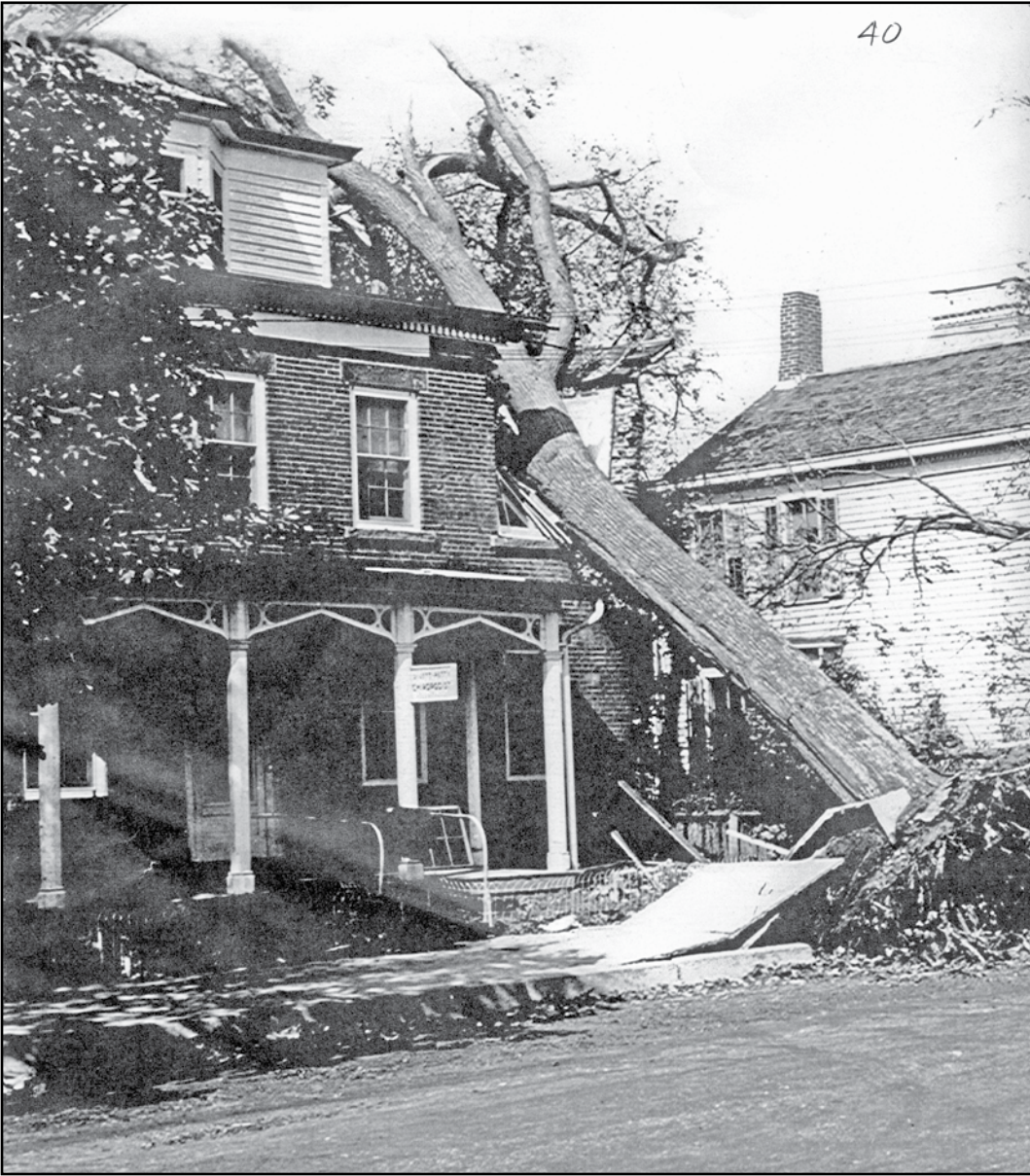
Damage to the Petty House in Greenport.