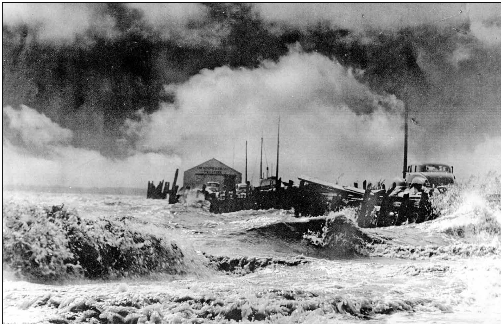
The ominous sky over the wharf in Orient during the Hurricane of '38 reflects the powerful threat of nature's forces. Possibly taken during the eye, this photo reminds us of the seriousness of today's hurricane warnings.