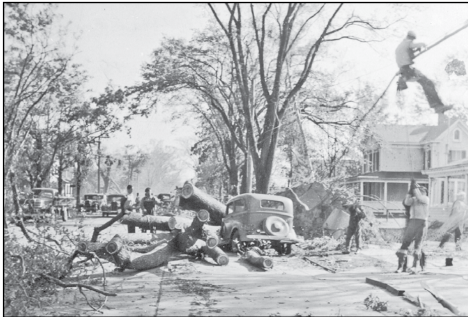
Corner of Oaklawn Avenue and Main Road, Southold.