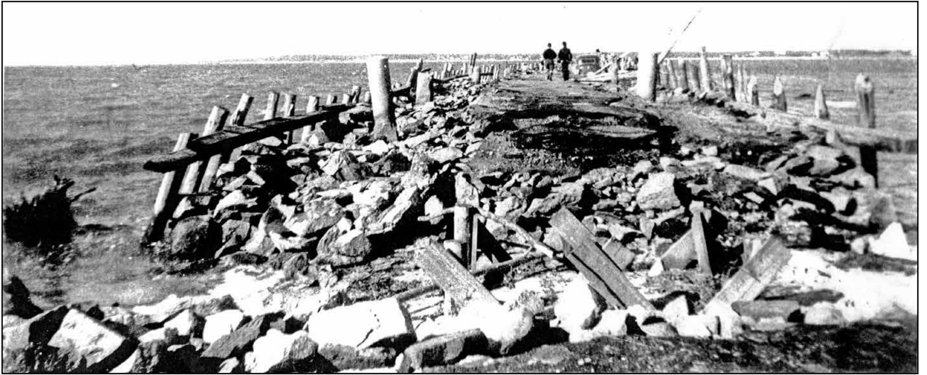
Hurricane damage to the Orient Potato Dock — now the Orient Yacht Club.