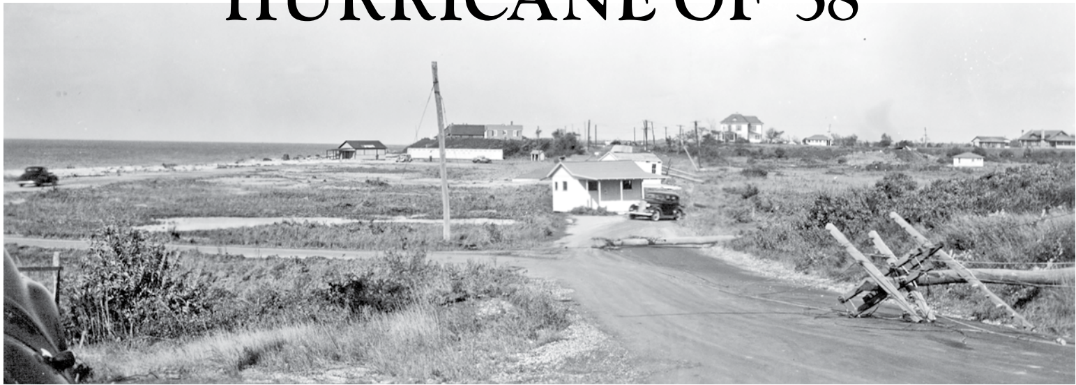
9/22/38 — Long Island Sound Town Beach, Southold. Jack's Shack on the beach.

Please note, this is an exact reprint as written in 2003, hence the opening line saying "65th Anniversary".