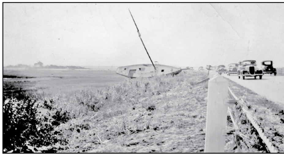
A view of the Orient Causeway after the hurricane.