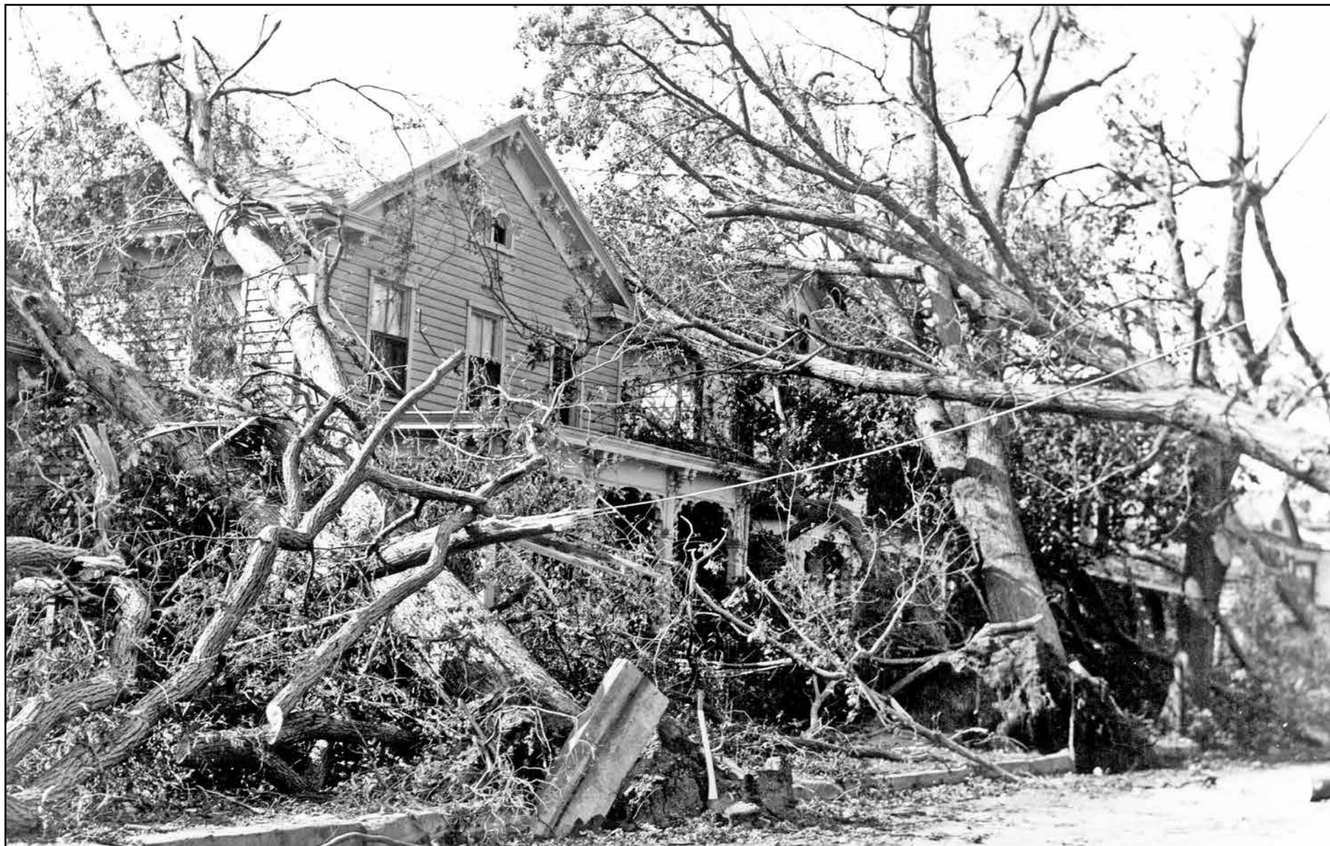
Main Street, Greenport.