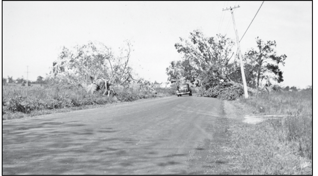
9/25/38 Cutchogue

Greenport and Orient were especially heavily damaged as one can see by the following photographs. Especially damaged was the buildings in Greenport Basin & Construction Company, now Greenport Yacht & Shipbuilding, and Claudio's. Over 600 trees were reported down in Greenport, the roof of the theater was torn