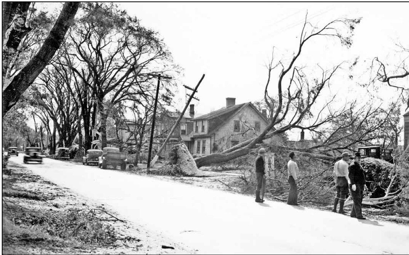
9/21/38 Residence of Leila Myers, Main Road, Southold.