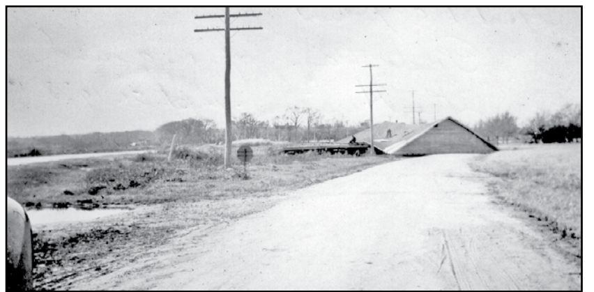
Point Road, Orient showing the potato building roof on the road after the hurricane.