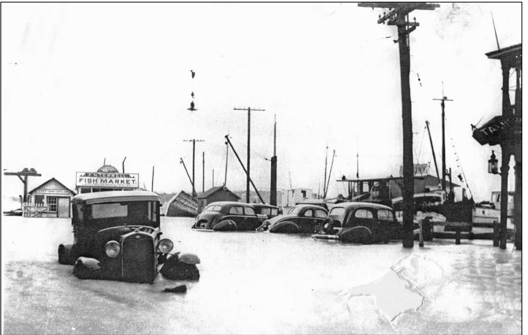
This photo shows the resulting flooding of lower Main Street, Greenport (south of Claudio's Restaurant).