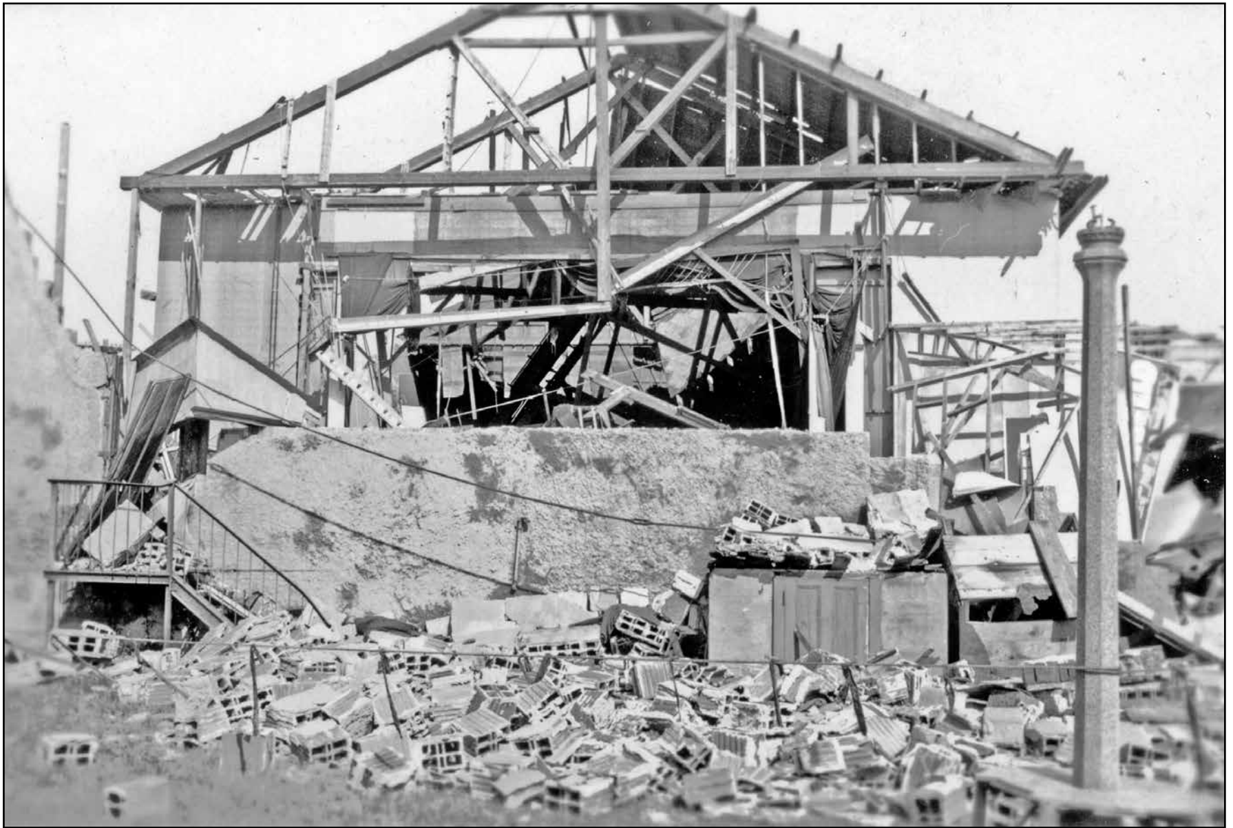
Another view of the Greenport Movie Theatre, courtesy of Frank Arnold.