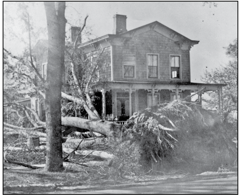
West Main Street, Southold, between Bowery Lane and Tuckers Lane. Residence of Bud Miller during the hurricane.