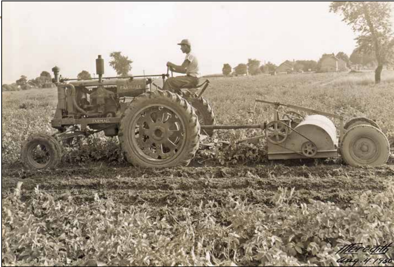
Potato Harvesting, circa 1950