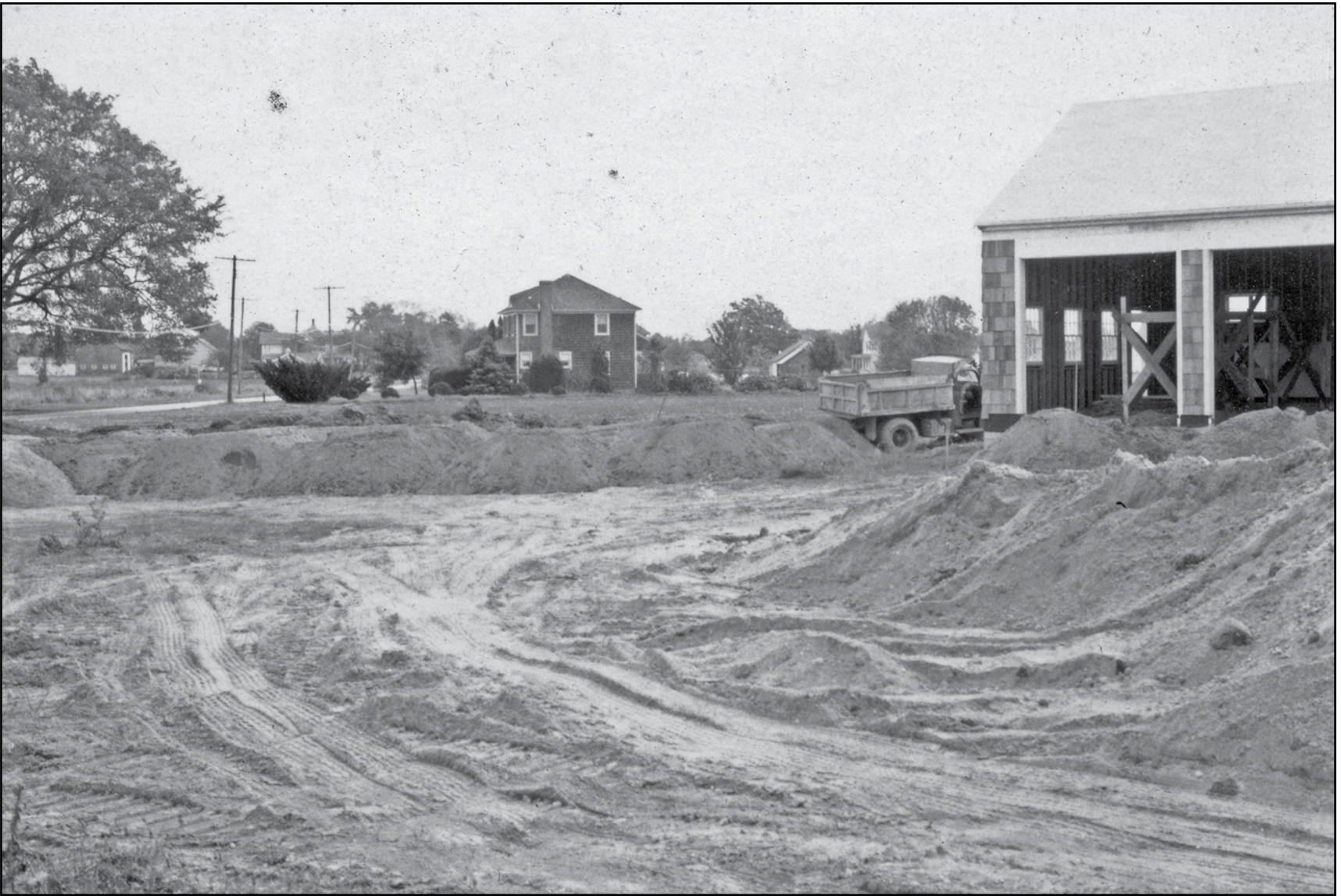
October 1959 looking south from Route 48, Youngs Avenue to the left.