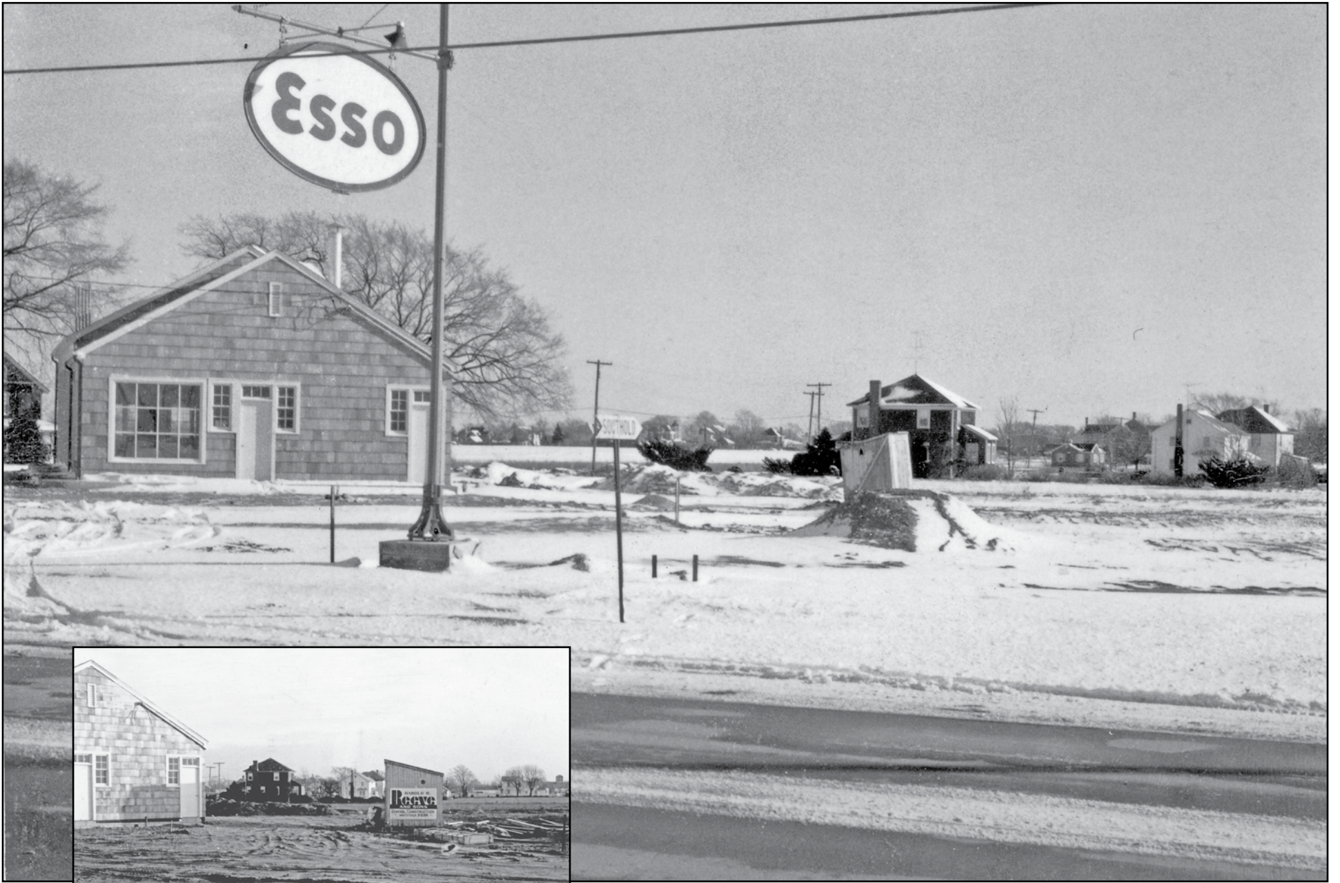
December 1959 (left) and January 1960 (above).