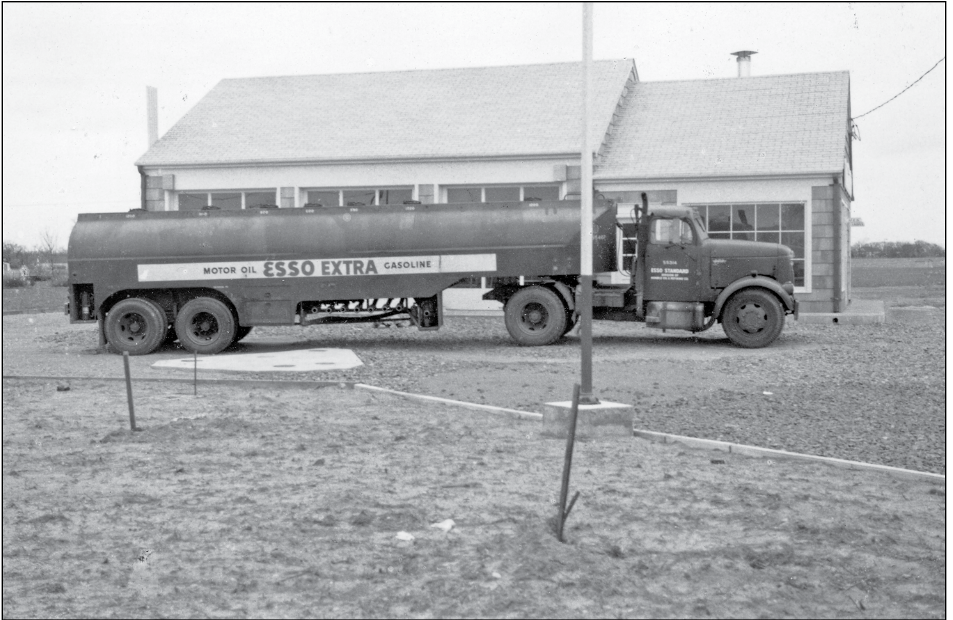
1960 Fuel Delivery