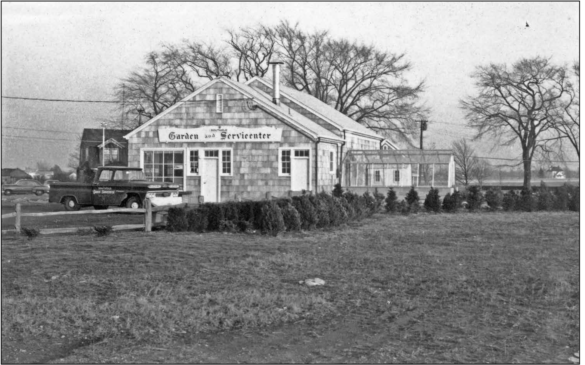
The "Garden and Servicer" in February 1961.