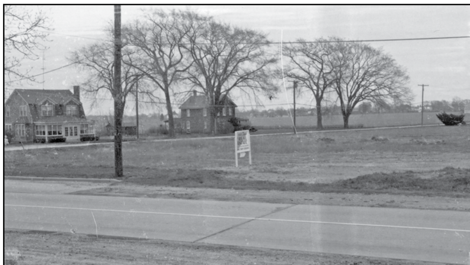
1959 views of the land, on the left from Youngs Avenue northwest to Route 48, and on the right southeast from Route 48 to Youngs Avenue. Below, the corner today, northwest from Youngs.

In 1959, Frank Abrams bought the empty land on the corner of Route 48 and Youngs Avenue, Southold to become the future location of his Esso gas station and garden center location. On the following pages we have photos showing the start of construction in 1959 to the completion in early 1961.